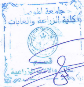
Head Of Department