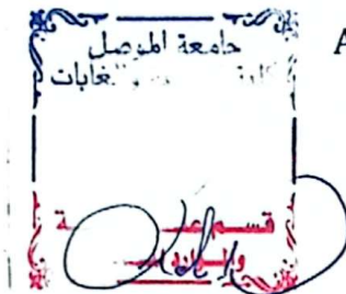
Head Of Department