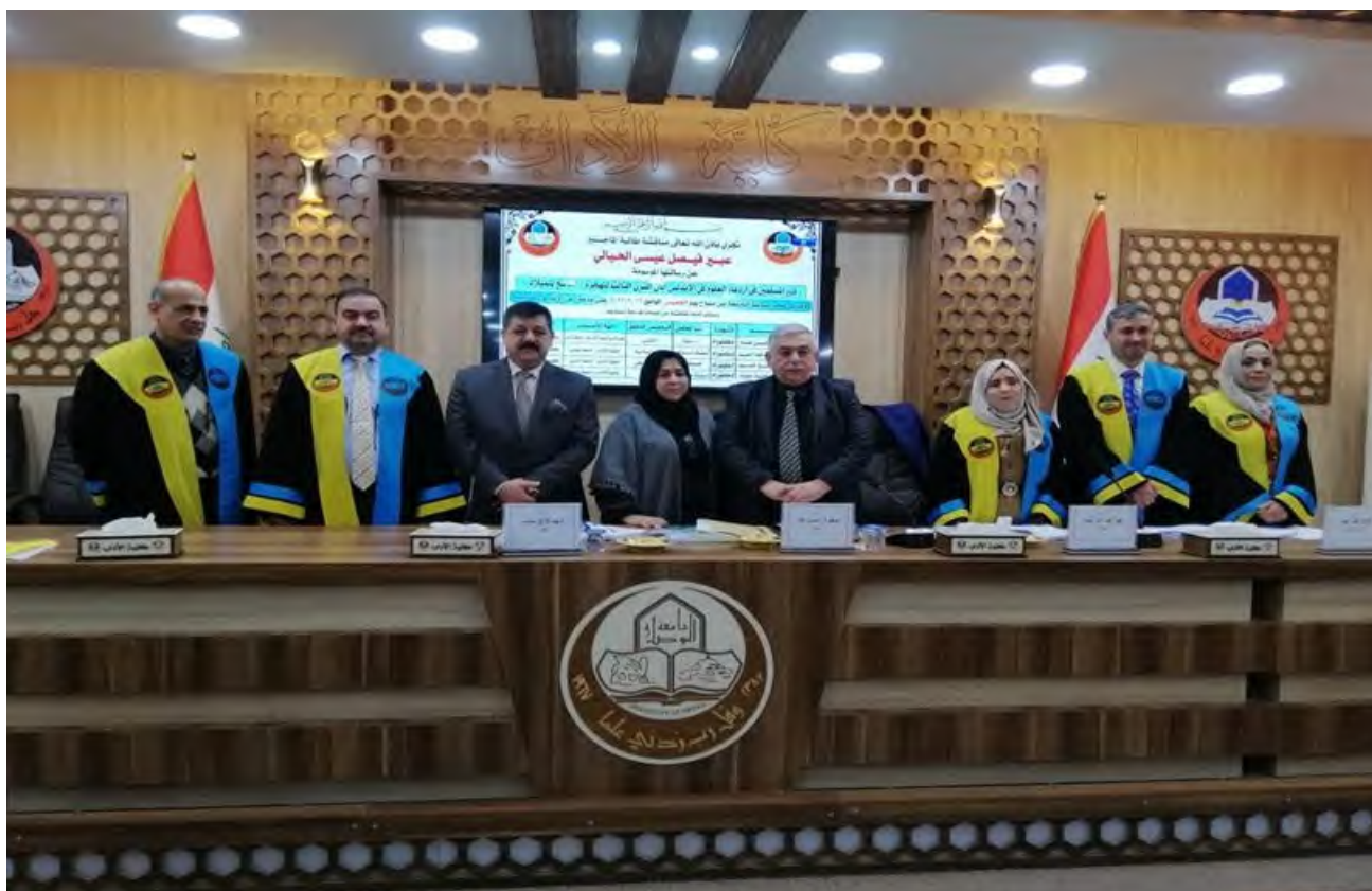
Photos of the master's thesis discussion in the presence of the then– University Assistant President for Academic Affairs