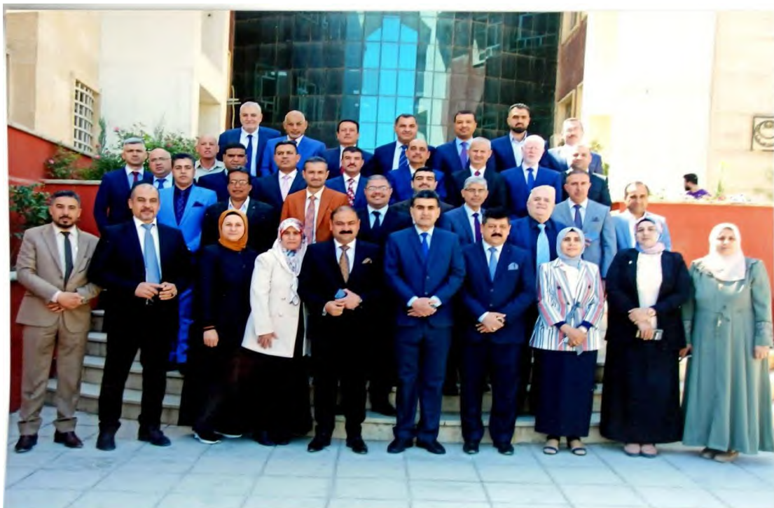
Faculty members in the Department of History