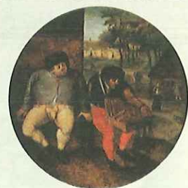
Cheating Benefits its Master by Peter Breugel