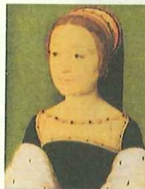
Madeleine of France by Corneille de Lyon

Both mother and son are now in prison for many years.