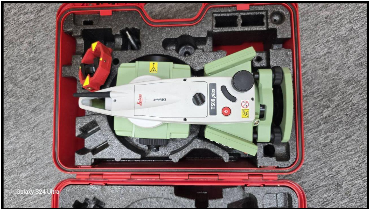
Galaxy S24 Ultra