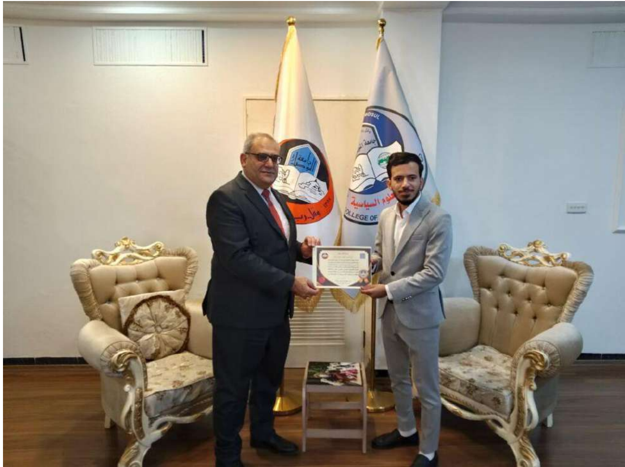
A group of female students from the College of Political Science at the University of Mosul participated in the training course for the "We Are Peace" project on December 12, 2024.