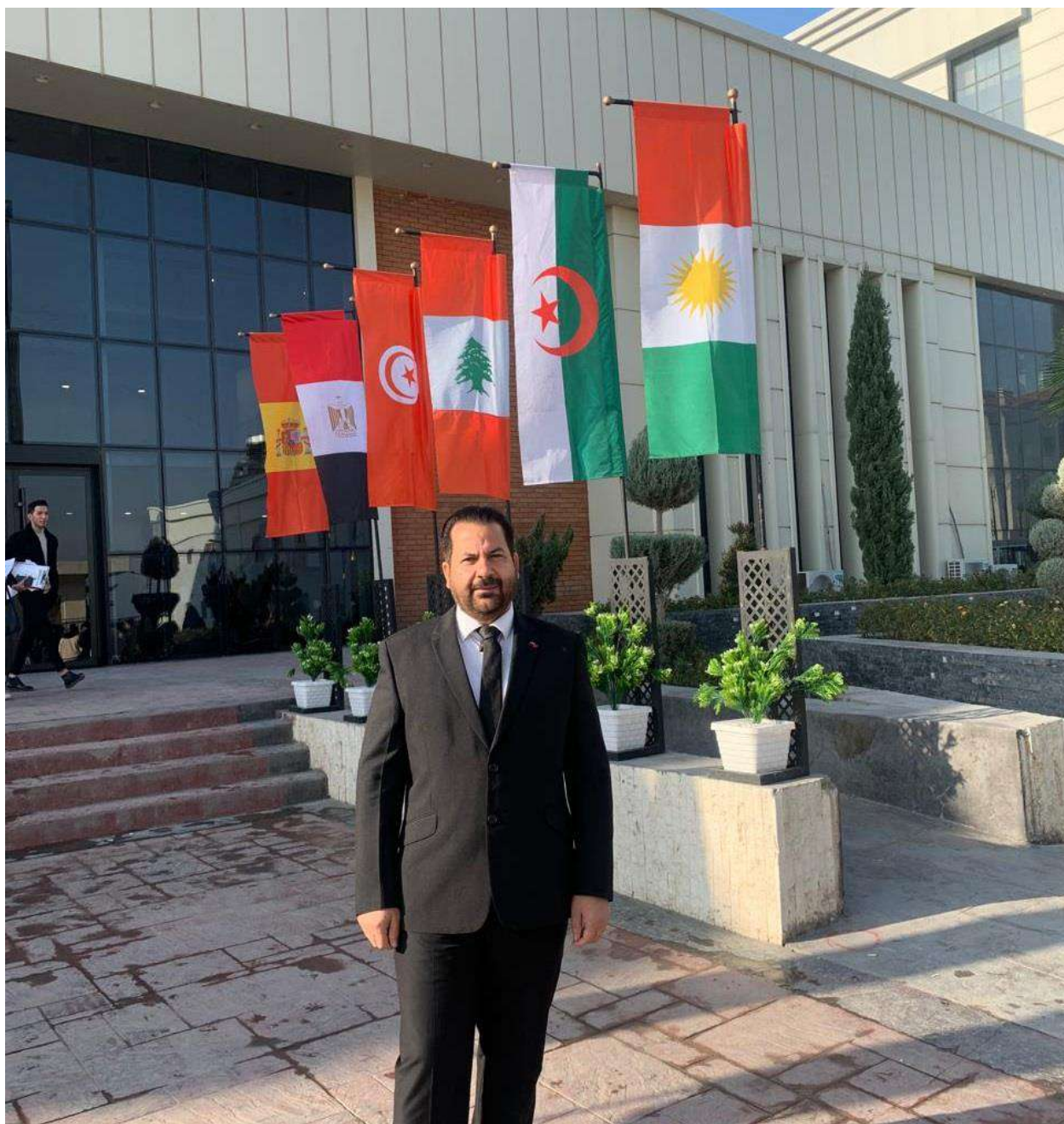
The Department of International Relations at the College of Political Science, University of Mosul, held an educational workshop for students on combating extremist ideology on November 5, 2024.