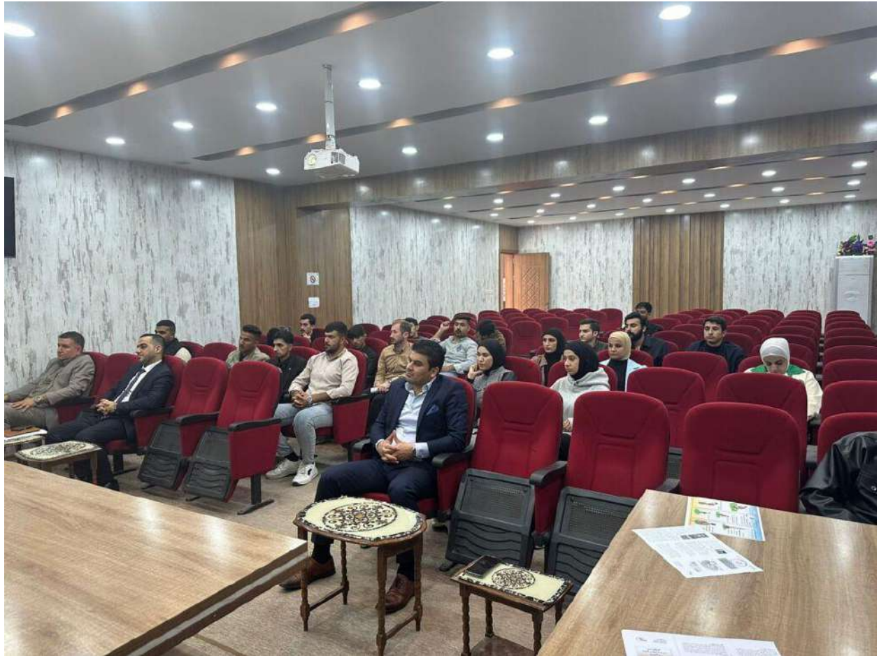
The College of Political Science at the University of Mosul, as one of the partners of the UNESCO Chair, attended the opening ceremony of the second edition of the Chair Week events organized by the university presidency on November 11,