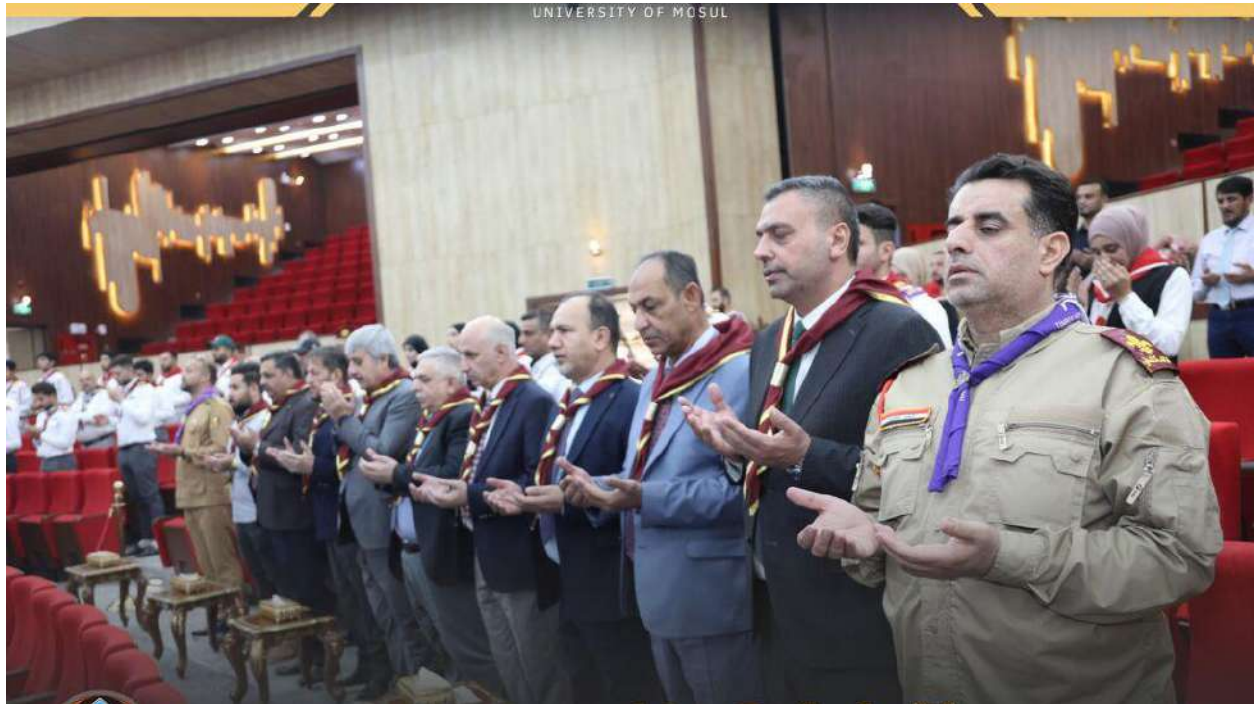
Activities of the College of Political Science with the UNESCO Chair — October 16, 2023