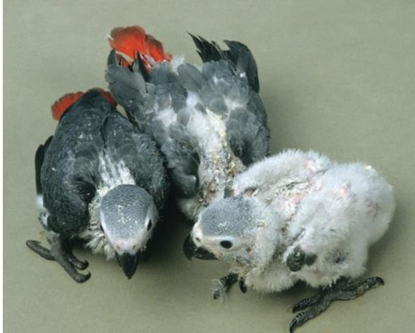
Acute PBFD in young Grey parrots ( Psittacus

erithacus erithacus ). Feather abnormalities may be generalized, but affected birds, especially young Grey parrots, may also die prior to developing the characteristic feather lesions, as a result of immunosuppression and secondary infections.