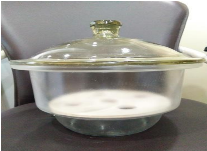
( Desiccator )

large mistakes so such food samples should be placed in the desiccator to prevent these cases.