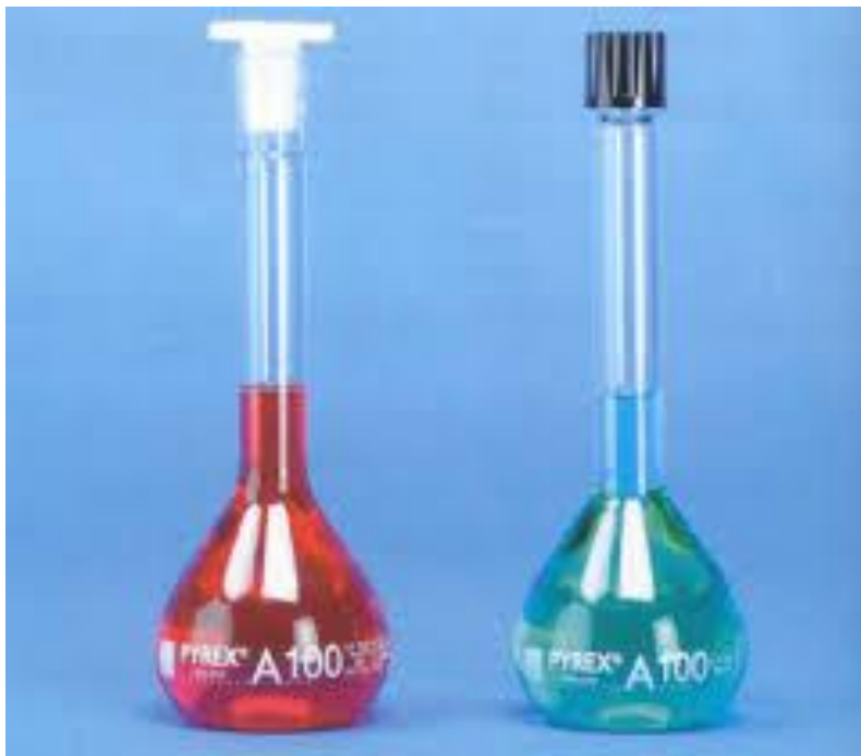
( Measuring flask )

There are many volumes of these flasks e.g. 100 ml. and 250 ml.