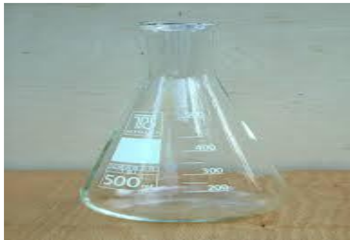
( Conical flask )

These are conical flask made from glass having broad bottom and thin opening, it is used as a receiving flask located bottom the burette . Usually, these flasks are used for dilution of stock and standard solutions. this flask is manufactured from Pyrex glass which is heat resistant .