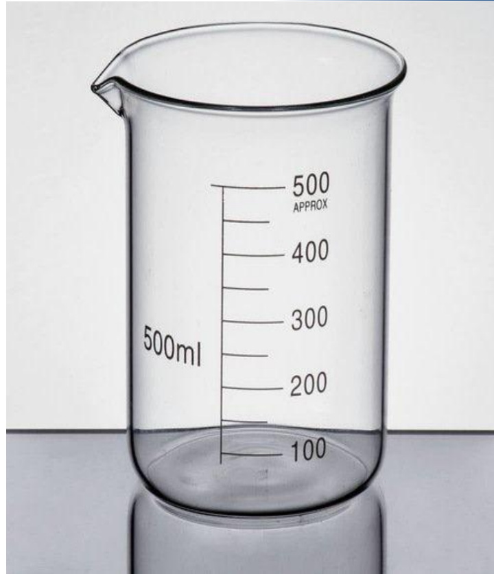
( Beaker )