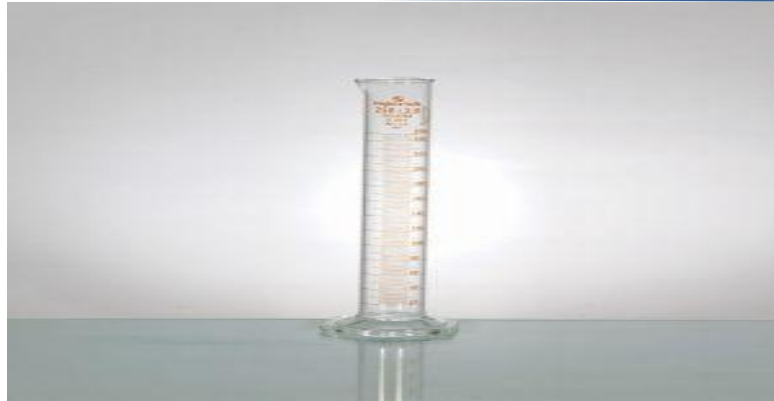
( Graduate cylinder )