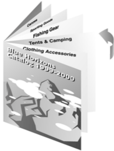
Reading a linear document